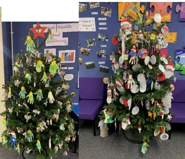
Sherard Primary School 'Diversitrees'