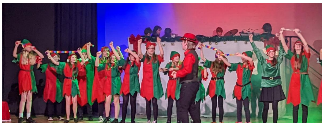
Iveshead School Show – 'Daydream Believer'