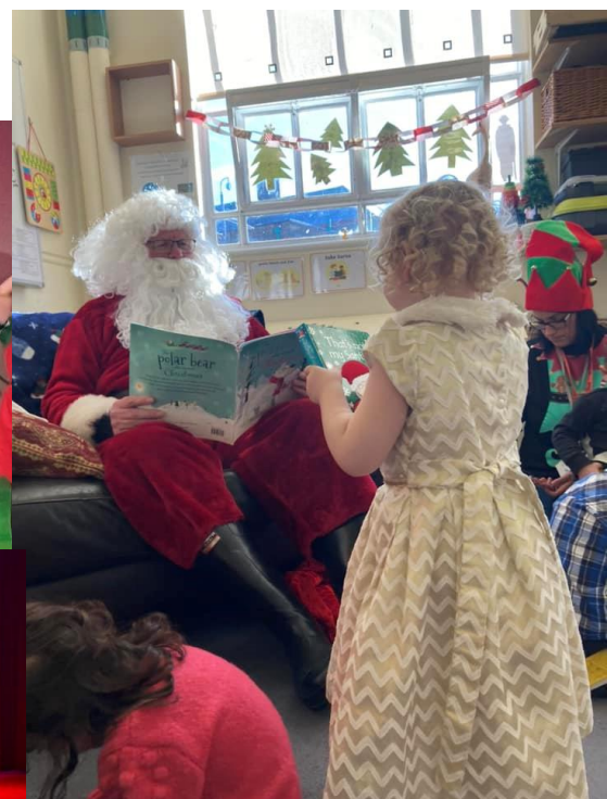
Santa visited Oasis Preschool and Retreat