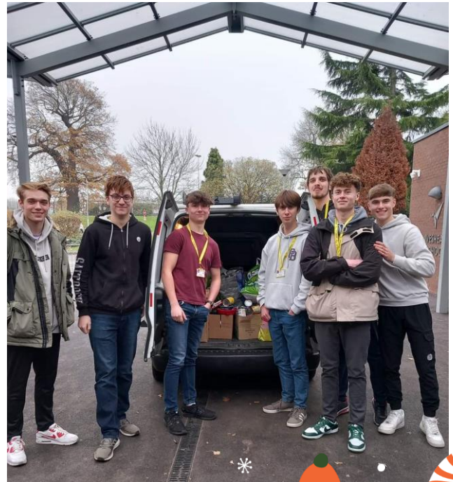
Iveshead School Foodbank Donations

It has also been wonderful to see the generosity shown towards the local community across our amazing schools, staff, students, and their families with heart-warming initiatives such as Winter Warmer rails and donations to local foodbanks to help those in need.