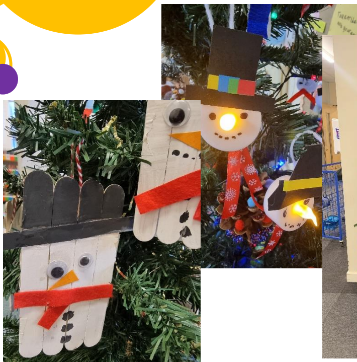
Decorations' Day at Somerby Primary School